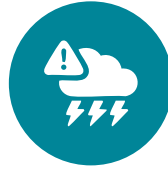
Severe Weather Events