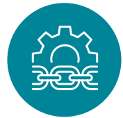
Supply Chain Disruptions