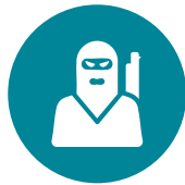
Acts of Terrorism